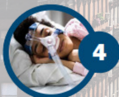
Respiratory Control Solutions