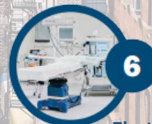
Electronic Surgical Systems