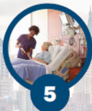
Electronic Drug Delivery Devices