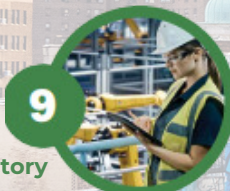
IoT and Factory Automation Systems