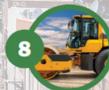
Electronics in Off- Highway Equipment