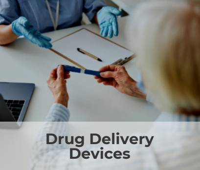
Drug Delivery Devices