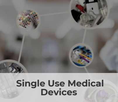
Single Use Medical Devices