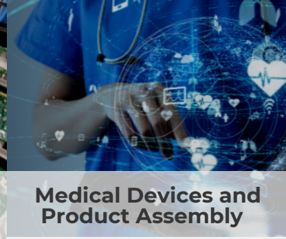
Medical Devices and Product Assembly